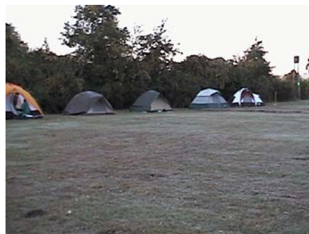
Scouts camped out in the Great Meadow late last fall.