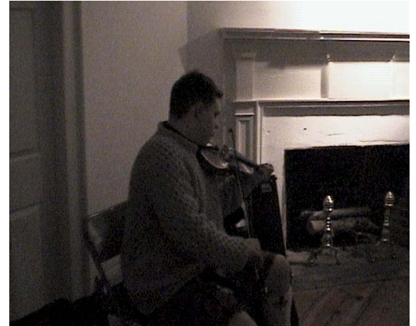
and the fiddle at Hogmanay.