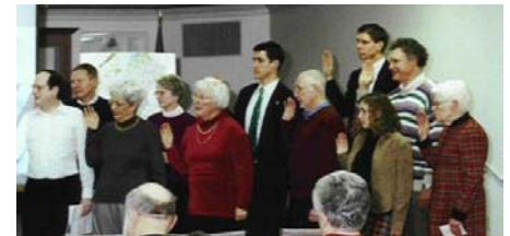
Board members are elected to one-year terms.