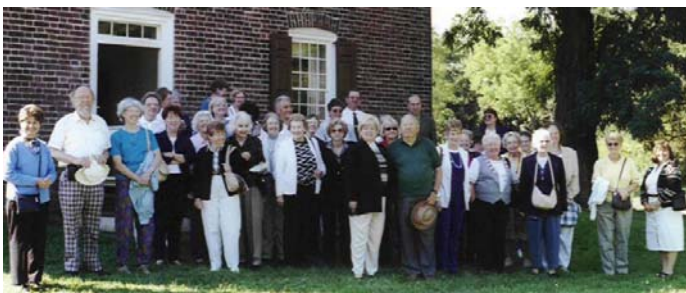
Member of the Lehigh Valley Historical Society pose

Visit the Lawrence Historical Society on the world wide web: www.TheLHS.org