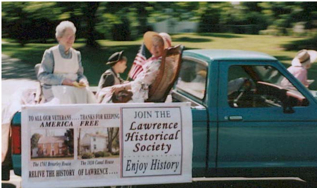
Many groups are finding out about the Brearley House...