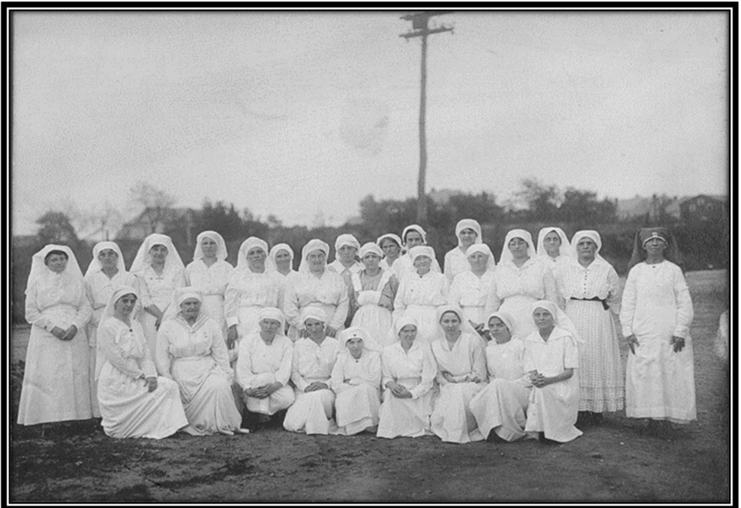
World War I Red Cross Workers, Slackwood 1918