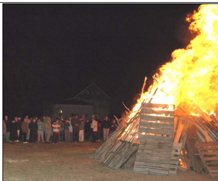
Flames shoot 25 feet in the air on December 31 st as Great Meadow guests celebrate Hogmanay