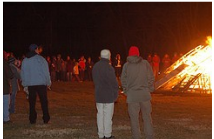
A large turnout at the bonfire in spite of the cold weather